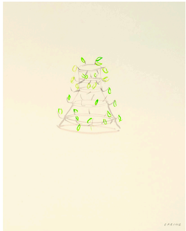
Bethan Huws, Spring , 2008

As a supplement to the work commissioned by the Galerieverein, Untitled (A WORK OF ART WITHOUT EMOTION IS NOT A WORK OF ART / ARE YOU SURE?) , 2020/2021, the Kunst Museum Winterthur presents an exhibition of her Works on Paper and the so-called Word Vitrines , connecting the two museum buildings on either side of Winterthur's Stadtgarten.